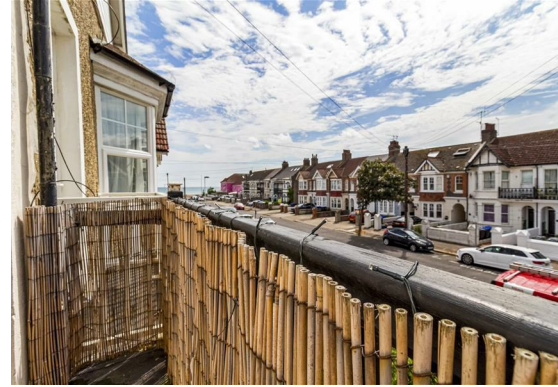
Balcony with sea views